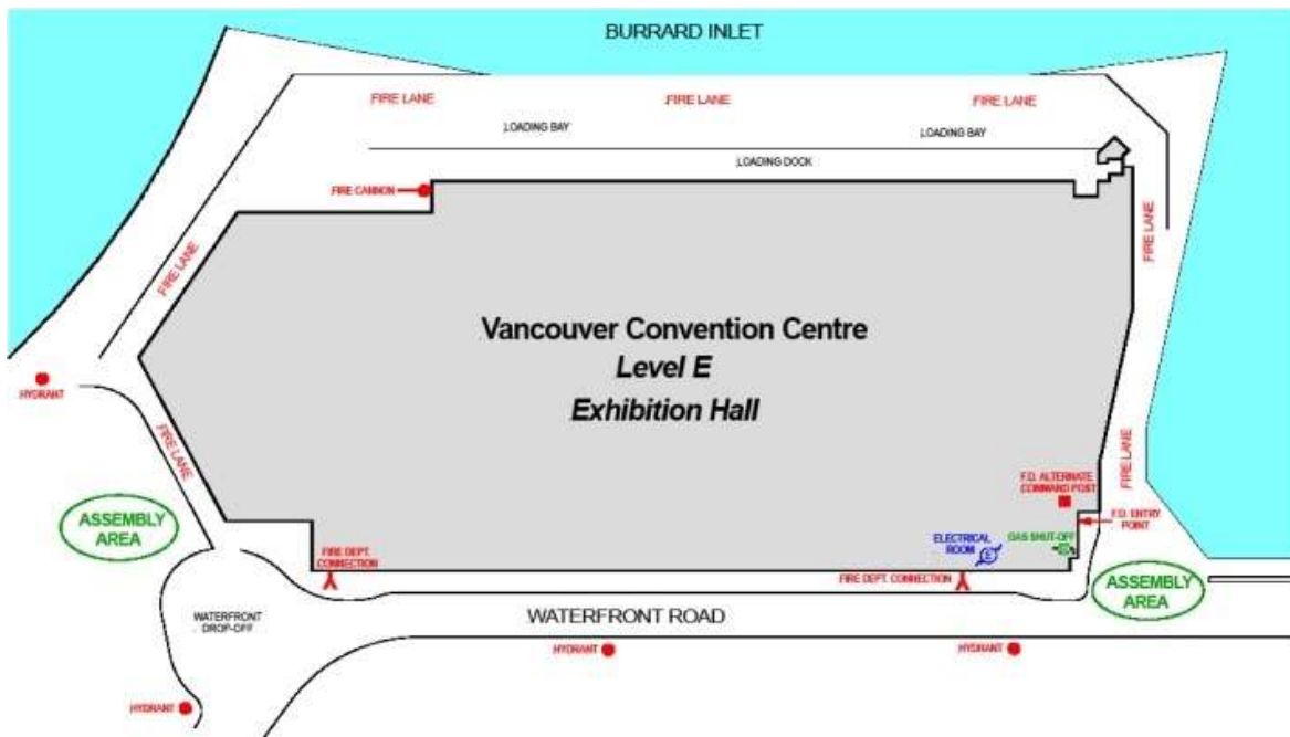
West building Exhibition Level Muster Stations